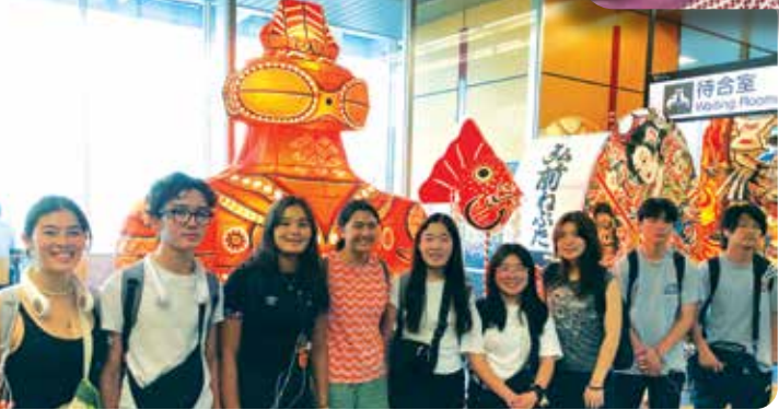
JR YBA: JAPAN 2023 JULY/AUGUST, 2023