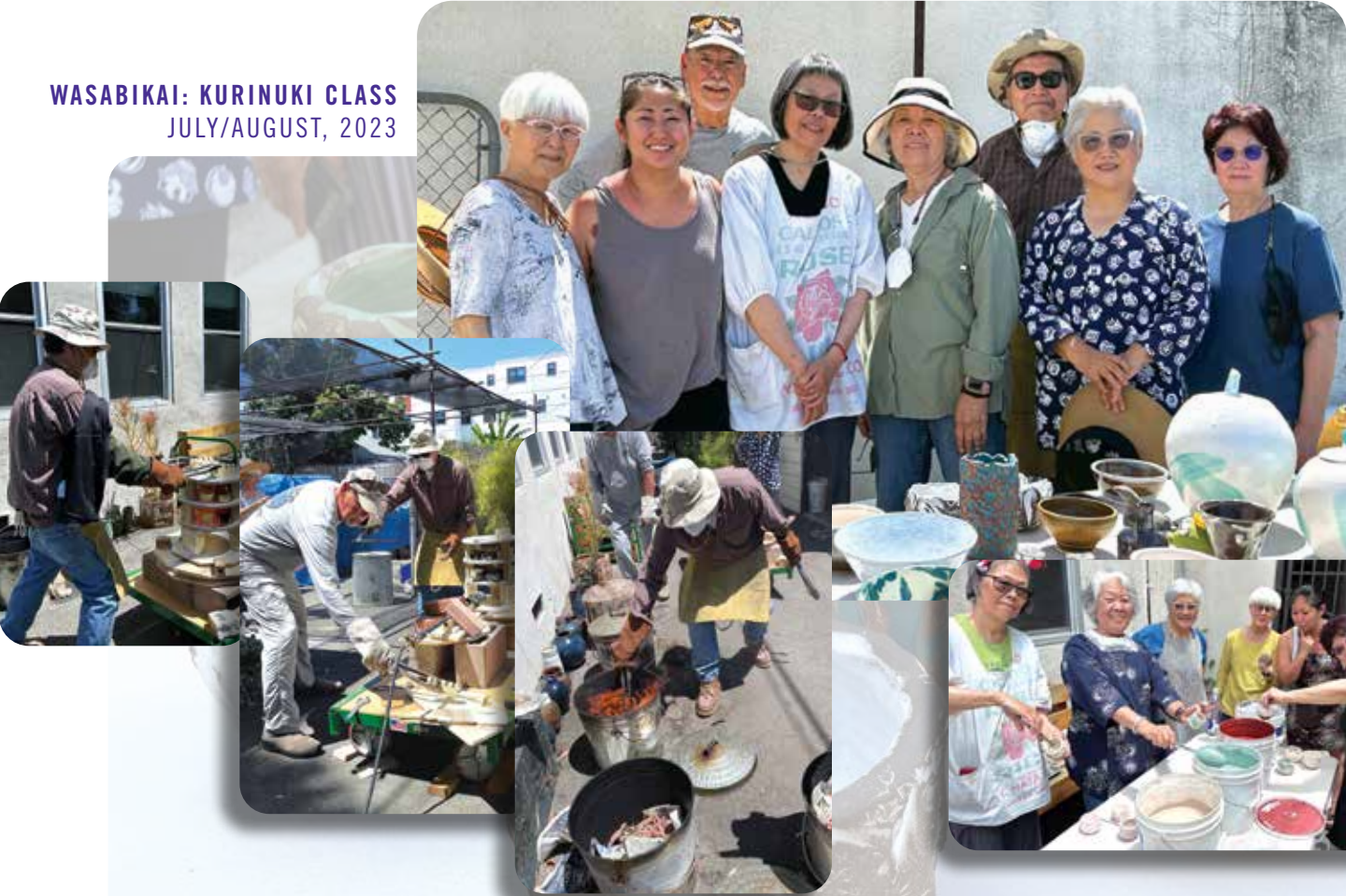
WASABIKAI: KURINUKI CLASS JULY/AUGUST, 2023