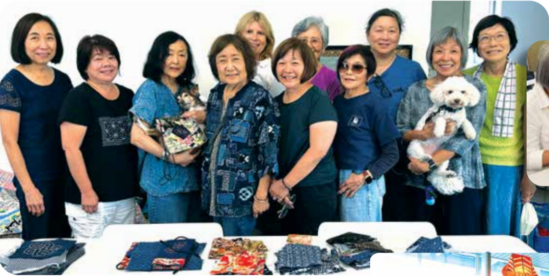
SASHIKO: JULY/AUGUST, 2023