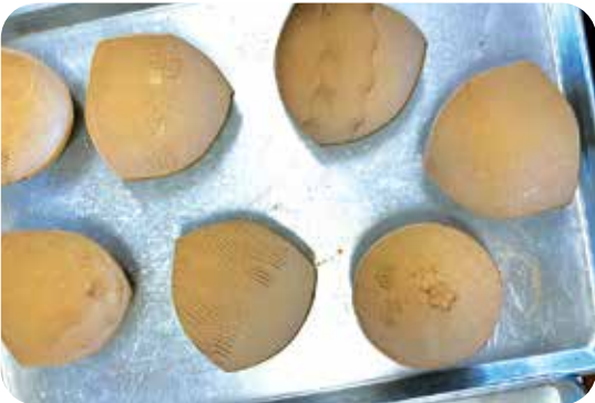
3RD - PLATES WITH 3 BALL FEET AND DIFFERENT PATTERNS that were rolled or stamped into the clay.

of each other, a wood block is pushed into clay that's cut a little larger than the block and is sitting on top of a thick piece of foam. The edges come up around the block forming a lifted edge to the plate. Each student decorated their plates with patterns and designs of their own choosing.