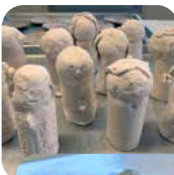
4TH - JIZO STATUES - the guardian deity of children and travelers. Little statues with