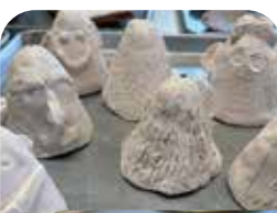
5TH - BELL SHAPED WIND CHIMES shaped into figures, animals, faces, or

prayer hands, some with ears, some with hair (?), decorated yukata, and the sweetest faces.