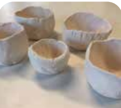
1ST - PINCH POTS. Individuality is seen in the size, shape, and thickness of each pot.

These are what the grades created this year: