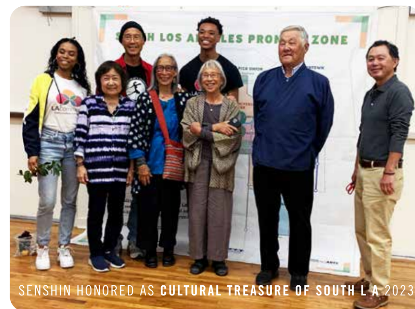
SENSHIN HONORED AS CULTURAL TREASURE OF SOUTH L A 2023