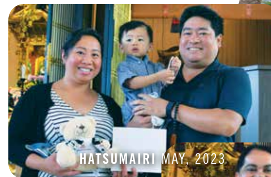
HATSUMAIRI MAY, 2023