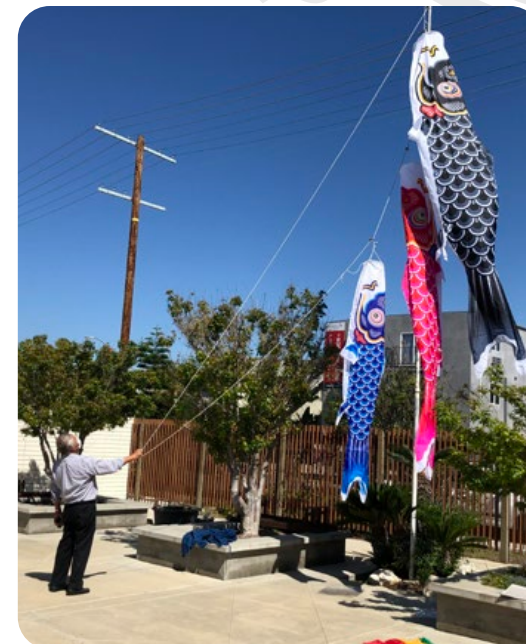
Koinobori, Carp streamer