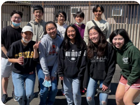
Jr YBA helping with spring cleanup