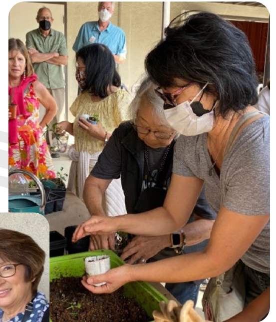
BWA Gardening Seminar