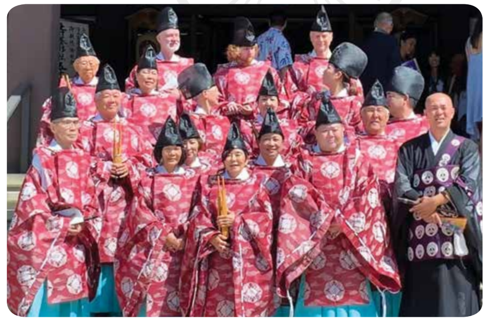
Kinnara Gagaku at Nishi Hongwanji 50th Anniversary Ceremony on September 8, 2019

Copies are still available from the Hongwanji Place Bookstore, located next to the Library at Senshin. For price and details, email Hongwanjiplace@ gmail.com or call (323) 731-4617.