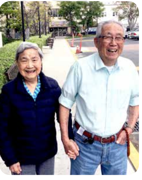
"We are good!"

Hanamatsuri 2019 "Keeping good friendships over a half-century."