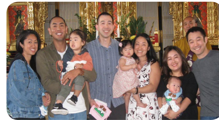
Hatsumairi 2019: Group photo of the three infants and their families.