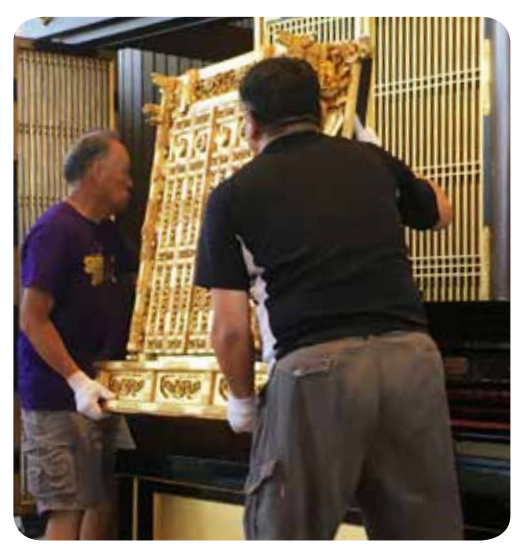
they will respect the Buddha and the Dharma. And vice versa, if people deeply respect the Buddha and Dharma,

It is often said that "The Onaijin nurtures the practitioners' hearts and minds." If the Onaijin is clean and shiny, people sense the importance of the Buddha and the Dharma and