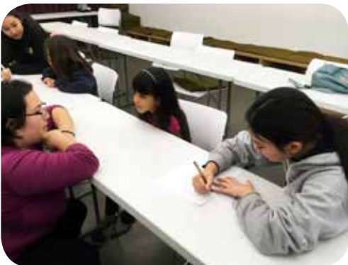
Above: Jr. YBA help with Winter Dharma School.