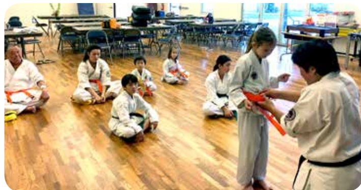
Senshin Karate Club members receive promotion to orange belts.

We are now forming a Senshin Karate Club. The purpose of this club is to enhance the physical and mental health of the temple members and their friends as well as learning Buddhist thoughts