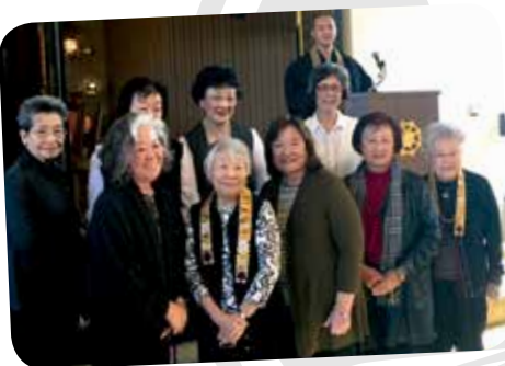
BWA 2015 Installation

We welcome all women to join the BWA in 2015. If you are interested, contact any BWA member. 2015 dues are $10.