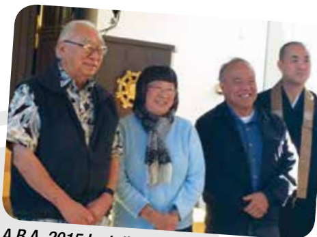
ABA 2015 Installation

Under the guidance of our new cabinet officers we hope to plan a very exciting and fun year. Here is our 2015 new cabinet: