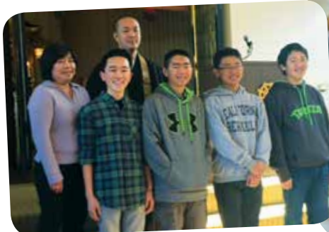
Jr. YBA 2015 Installation