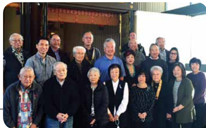
Senshin Board of Directors 2015 Installation

The ABA meeting is held the first Sunday of every month at 9:30am in the kitchen or wherever we can meet. So please join us for a fun and exciting new year.