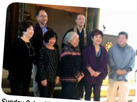
Sunday School Teachers 2015 Installation

The next Jr's meeting will be on February 1st at 9:20am before service.