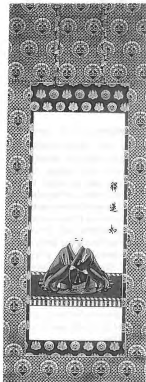
Rennyo Shōnin - 蓮如上人 - Rennyo-lofty-person : 1414-1499 ad. The eighth hereditary Gomonshu from the bloodline of Shinran Shōnin. He was largely responsible for the restoration of Jōdoshinshū teachings as a major force in Japanese Buddhism and for organizing the sect into its present form.