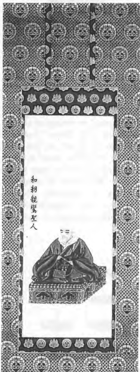
Shinran Shōnin - 親鸞聖人 - Shinran-sage-person : 1173-1263 ad. Founder of Jōdoshinshū and one of the great figures of Japanese Buddhism.

Yoma - 余間 - remaining-space : The last series of altars are the Yoma or remaining space to the extreme right and left of central altar. On the extreme right is enshrined a picture of Shōtoku Taishi and on the extreme left a picture of the Seven Patriarchs of Jōdoshinshū.